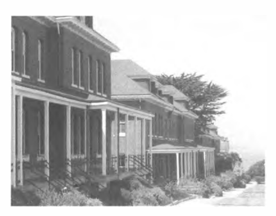
Former Army housing at the San Francisco Presidio.

The Army must prepare a "planning level survey," which describes the installation's past and present missions, notes activities that may affect historic properties, identifies known or anticipated cultural resources, and requires an annual inventory. The HPC lists "categorized undertakings" that could occur during the five-year planning period, such as maintenance, repair, ground-disturbing activities, renovation, adaptive reuse, rehabilitation, substantial alteration, demolition, mothballing, and disposal through transfer, sale or lease. The HPC may include Advisory Council-approved "categorical exclusions" from Section 106 review.