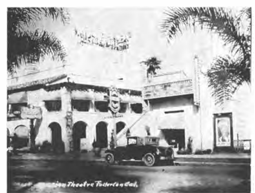
Fox Fullerton Theatre in Fullerton, CA.

In Orange County, concerned community members have formed the integrity of the historic