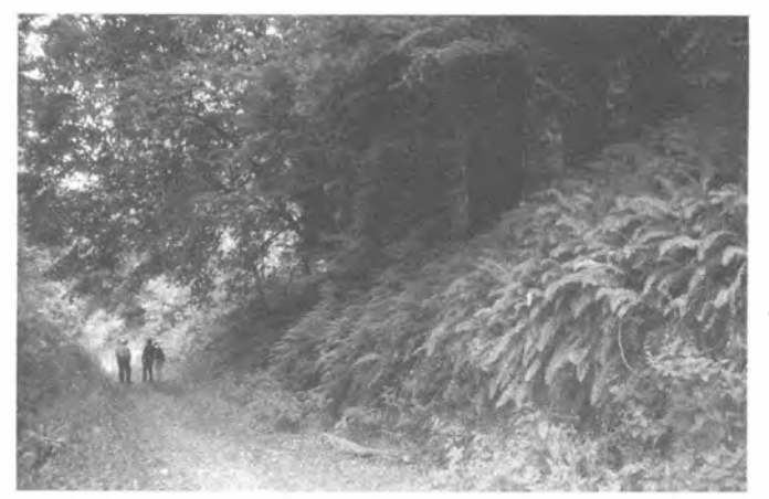
Community members would like to see this historic corridor developed as a multi-use trail for recreation and transportation.

service on the Annie & Mary route. However, winter storm damage south of the Humboldt Bay region demanded significant resources at