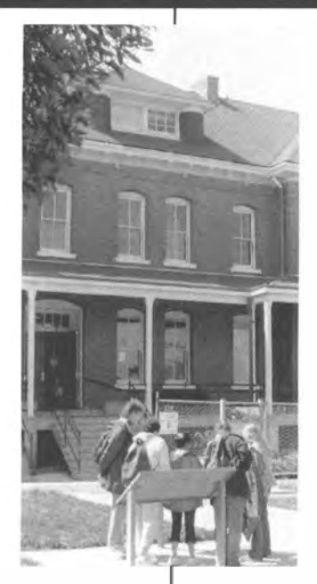
Visitors read about historic Army housing in the San Francisco Presidio.