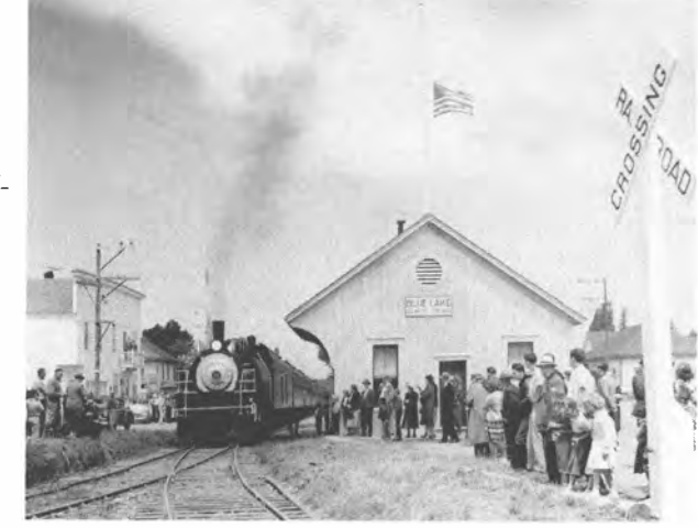
The former train station in Blue Lake is now the home of the Blue Lake Museum.

This out-ofservice line is owned by the North Coast Railroad Authority (NCRA), a public non-profit chartered by the State of California in 1992. Although freight trains have not run on the Annie & Mary spur